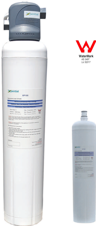
XP195 hard scale treatment system and replacement cartridge