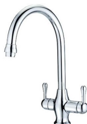
Three in One

The twin under sink water filtration system has long been the most popular choice for residential use, renters and caravan drinking systems.