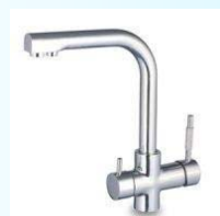
All in one