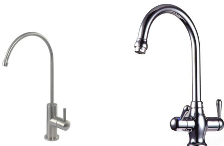
Stainless steel faucet